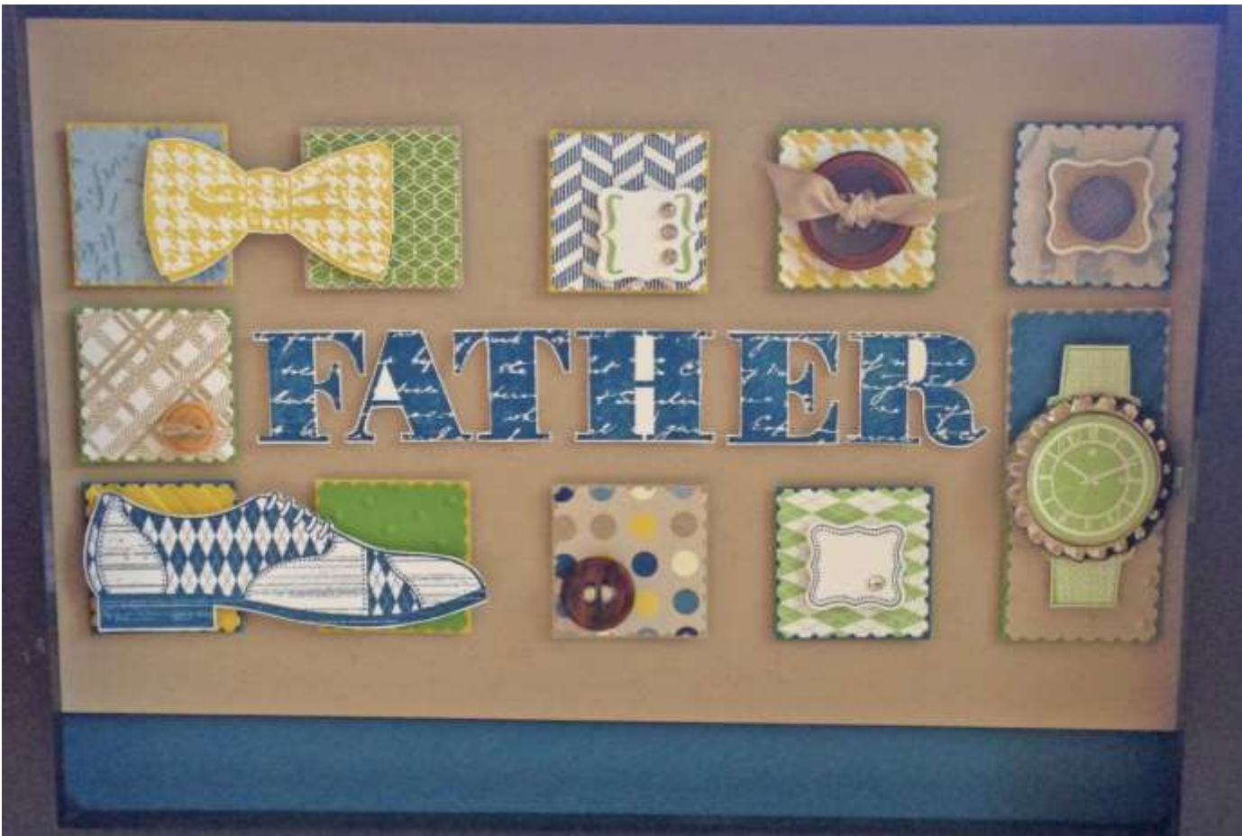
Father's Day Shadow Box Insert

Supplies used: Dapper Dad, Morning Post Alphabet, Pretty Petites & Beyond Plaid stamp sets; Not Quite Navy, Whisper White, Gumball Green, Summer Starfruit & Crumb Cake CS and inks; 1 ¼" Square, Postage Stamp, Petite Curly Label & 1" Circle punches; Chevron & Perfect Polka Dots embossing folders; Brushed Bronze, Designer Naturals and Corduroy Basic Gray (retired) buttons; Soda Pop Tops; Linen Thread; Crumb Cake taffeta ribbon; self-adhesive Rhinestones.